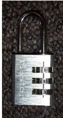
Fig. 3: Picture of the lock.

6.j) The combination of the lock is 183. Input the combination from top to bottom (see Fig. 3).