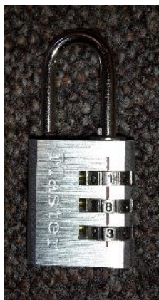
Fig. 3: Picture of the lock.

6.l) The combination of the lock is 183. Input the figures from top to bottom.