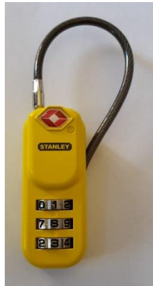
Fig. 3: Picture of the lock.

6.l) The combination of the lock is 183. Input the figures from top to bottom.