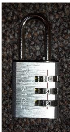
Fig. 3: Picture of the lock.

6.l) The combination of the lock is 183. Input the figures from top to bottom.