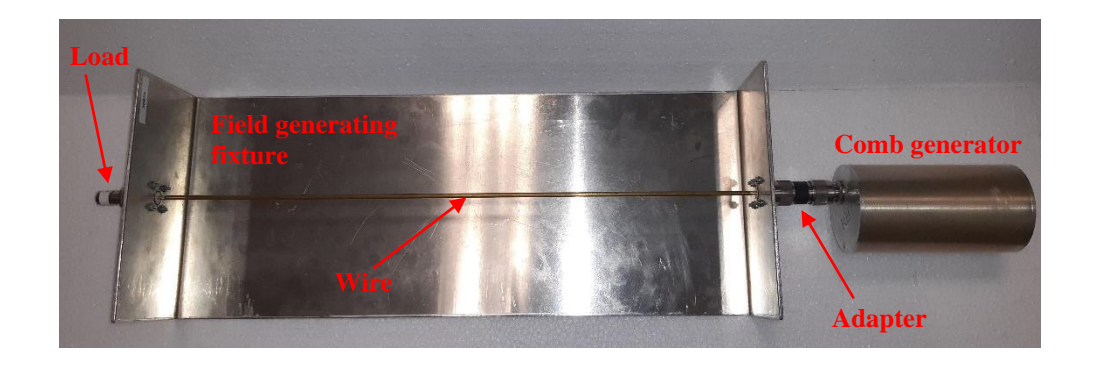
Fig. 2: Picture of the Sample (comb generator, adapter, field-generating fixture, load and wire).

6.h) The field-generating fixture consists of a round wire whose diameter is 4 mm, placed at 5 cm height above the ground plane and having 50 cm length. The wire runs between two vertical plates whose size is 20 cm x 10 cm. Two N-type, female, connectors permit to connect the wire to the comb generator on one side, and to the load, on the opposite side. The comb generator has an N-type, female, connector, hence a male-to-male, N-type adapter is provided by the Coordinator for connecting the comb generator to the field-generating fixture.