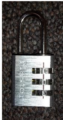
Fig. 3: Picture of the lock.

6.g) The Sample is enclosed in a case. The combination of the lock locking the case is 183. Input the figures from top to bottom.