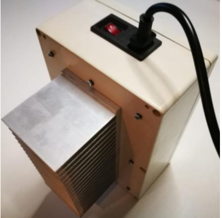
Fig. 2: Picture of the Sample-

6.g) The Sample is enclosed in a case. The combination of the lock locking the case is 183. Input the figures from top to bottom.