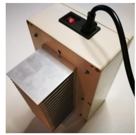
Fig. 2: Picture of the Sample-

6.g) The Sample is enclosed in a case. The combination of the lock locking the case is 183. Input the figures from top to bottom.