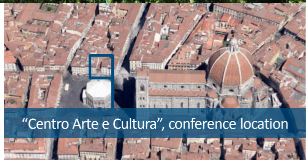
“Centro Arte e Cultura”, conference location