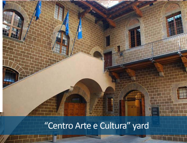
“Centro Arte e Cultura” yard