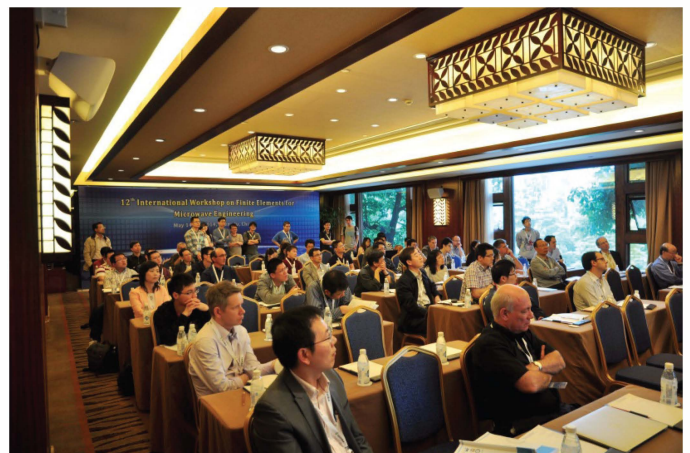
Figure 5. The technical sessions in Taian Hall.