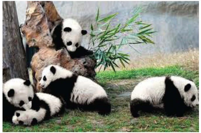
Figure 23. The Giant Panda Breeding Base: giant pandas are not only a Chinese national treasure, but are also beloved by people all around the world.