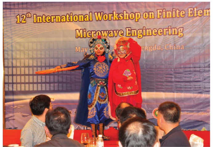
Figure 17. The FEM2014 attendees enjoyed a famous Sichuan face-changing show at the closing banquet.