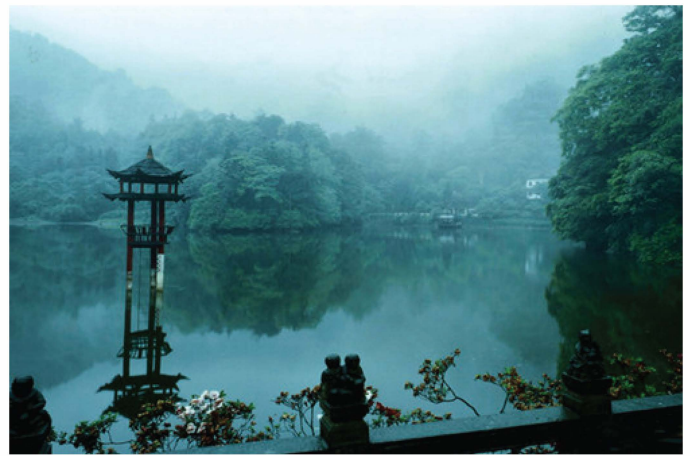
Figure 4. Beautiful Lake in Mount Qingcheng.