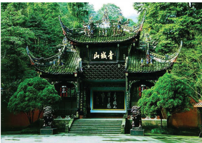
Figure 3. Mount Qingcheng, one of the birthplaces of Chinese Taoism, called “Dong Tian Fu Di” (which means a wonderful mountain and happy place). It was only a walking distance from the FEM2014 hotel, and many attendees hiked over there.