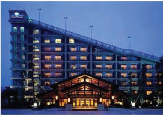
Figure 1. The FEM2014 hotel: Howard Johnson Conference Resort Chengdu, located at the foot of Mount Qingcheng, one of the birthplaces of Chinese Taoism.