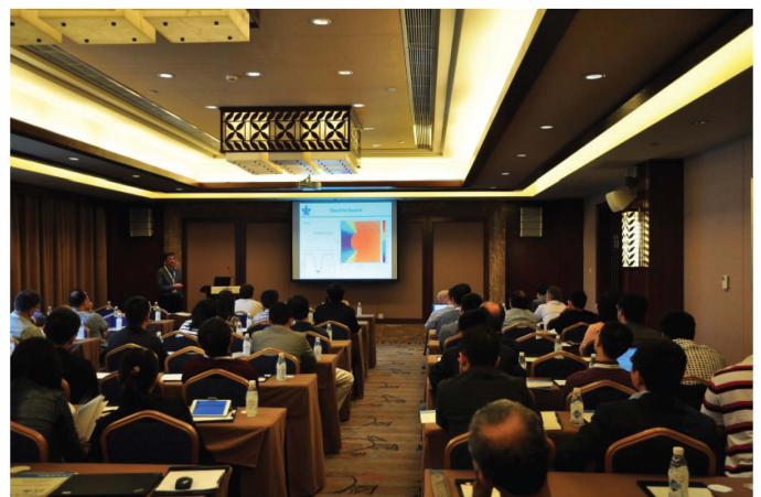
Figure 6. The technical sessions in Longchi Hall.