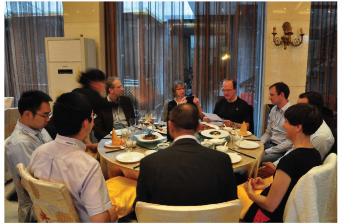
Figure 16. The closing banquet of FEM2014 at De Xing restaurant, on May 16, 2014.