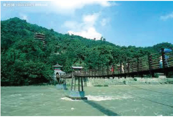
Figure 22. The oldest and only surviving no-dam irrigation system in the world, and a wonder in the development of Chinese science.