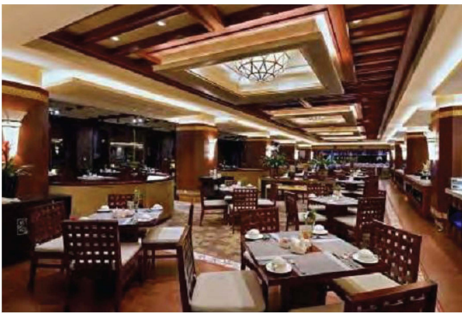
Figure 2. The FEM2014 restaurant: Maya Cafe in Howard Johnson Conference Resort Chengdu, where breakfast, lunch, and dinner were served and the reception was held.